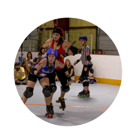
SPONSOR LEVELS PAGE 4